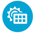
Off grid solar system